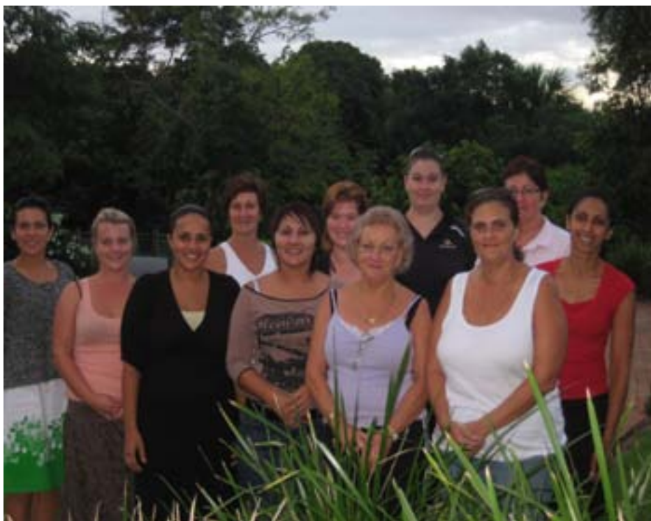
Forest Gardens 'Weight Loss Challenge' participants preparing for the big challenge.

Twelve weeks ago a group of local Cairns weight loss coaches issued a challenge to the Cairns local community to lose weight over a 12 week period using weekly get-togethers, information sharing and group motivation. Two Weight Loss challenges started and the results were truly amazing.