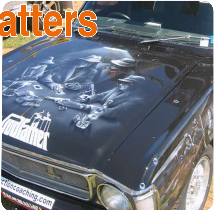
2006 Variety Bash Car

For more information on merging and road rules in general, visit Queensland Transport's website at www.transport.qld.gov.au .