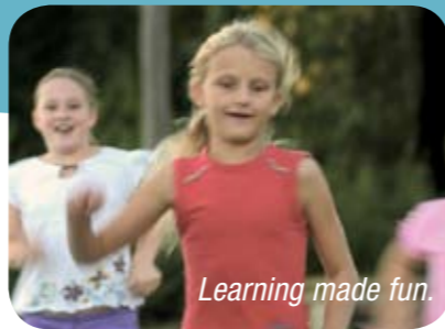
Learning made fun.

DID YOU KNOW Caring for just one dog costs the shelter $10 each day?