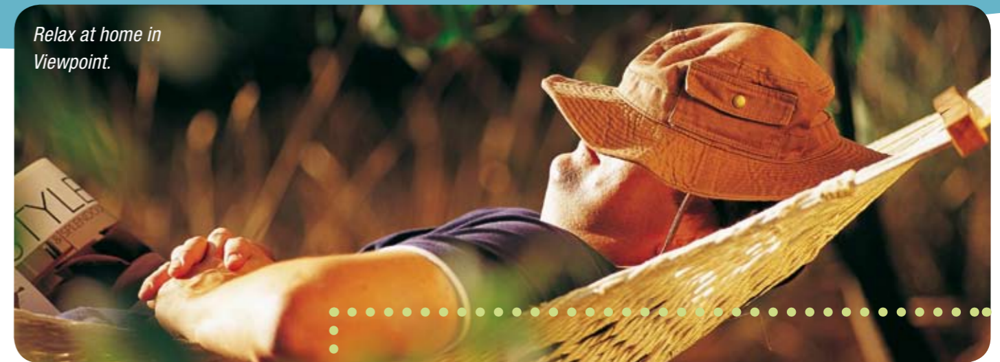
Relax at home in Viewpoint.